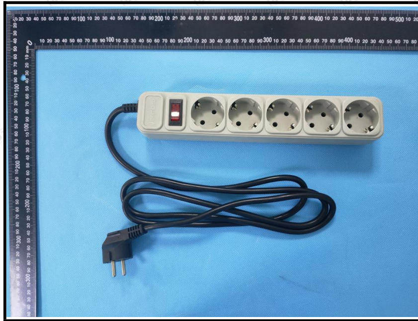
Photograph of Sample